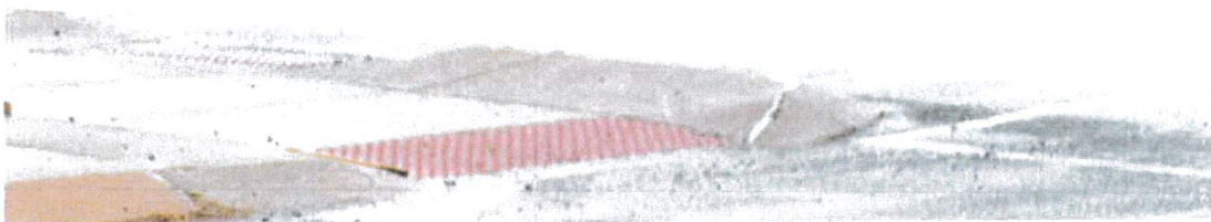
Location #1 - Across from Lowe's Entrance