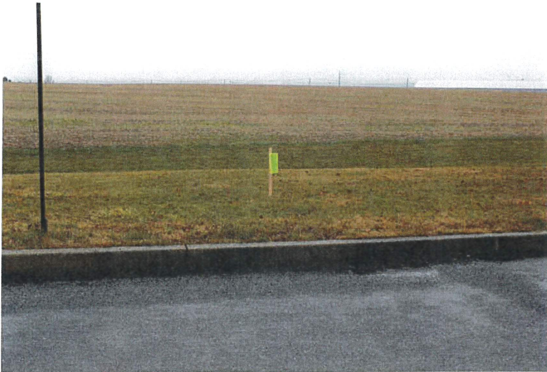
Location #3 - Along Highcroft Dr. near bend