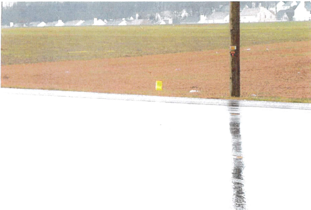
Location #2 - Across Main St from Dunkin Donuts