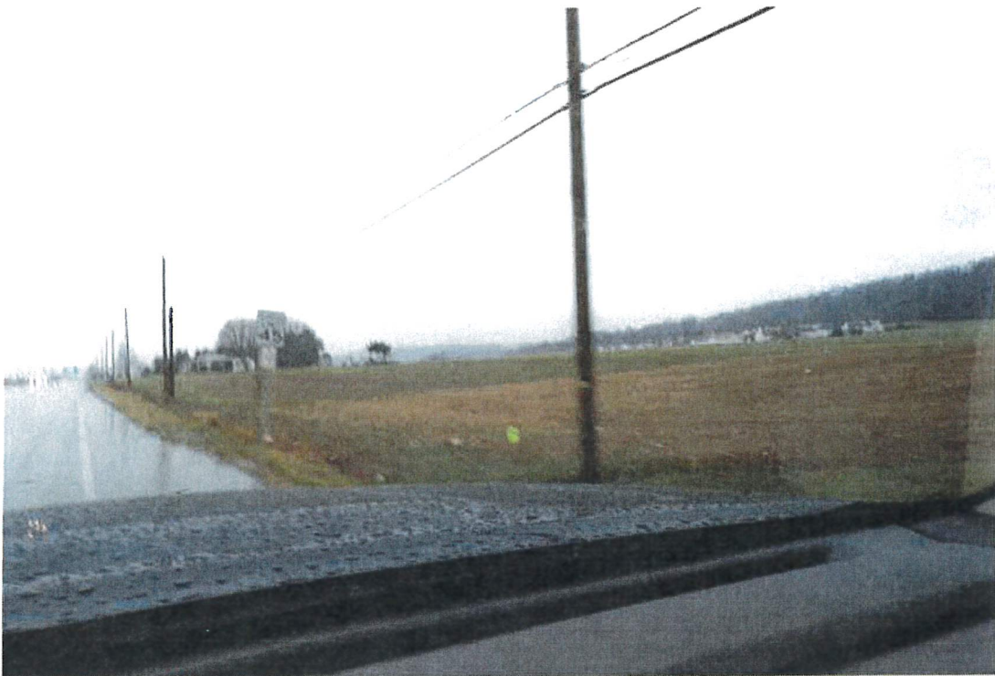
Location # 2 - Across Main St. from Dunkin Donuts