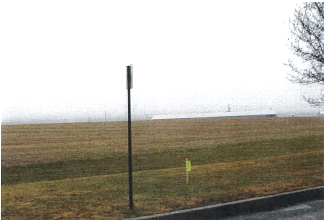
Location #3 - Along Highcroft Drive near bend.