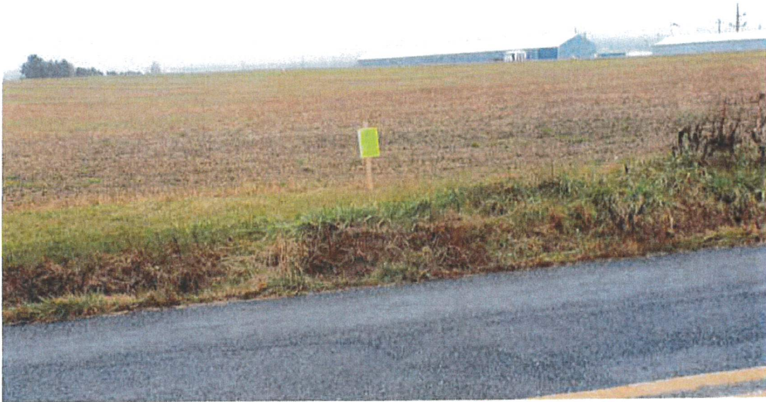
Location #4 - Along Willow Glen Rd Across from Modular Office at Morgan Corp.