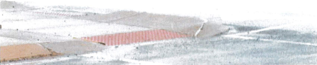
Location #1 - Across from Lowe's Entrance